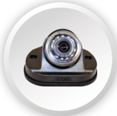
Bullet Wedge Camera