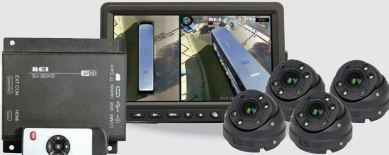
See sample views on page 5.