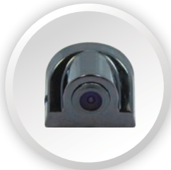
Mini Wedge Back-Up Camera