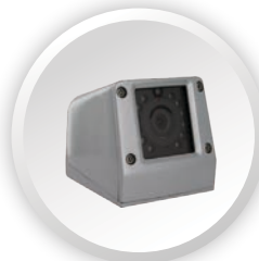
Exterior Side-Mount Camera