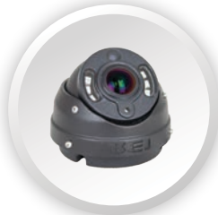
Surface/Recess-Mount Mini Eyeball Camera